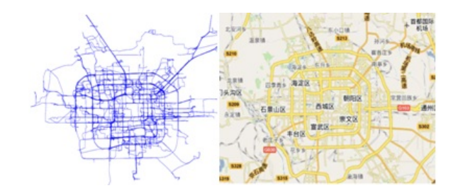
Figure 3. Coverage of the city by taxis; (left) the accumulated traces of ten taxis in one day (7 am - 9 pm)

This main metropolitan sensing network has a large number of sensor nodes which work in a distributed manner, so that the low cost design and energy efficiency protocols are the main features of this network. Differing from the conventional sensor networks whose protocol stack is composed of four layers, we designed a six-layer protocol stack, see Figure 2. The MAC and PHY layer are compliant to IEEE 802.15.4. We replace the ROUTE layer with IP layer which is running IPv6 protocol. Moreover, the node can be