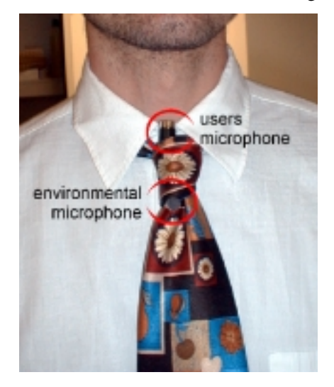
Figure 4: Context-Awareness Tie.

The hardware of our context-awareness component is build around a TINY-Tiger microcontroller, which offers four analog inputs