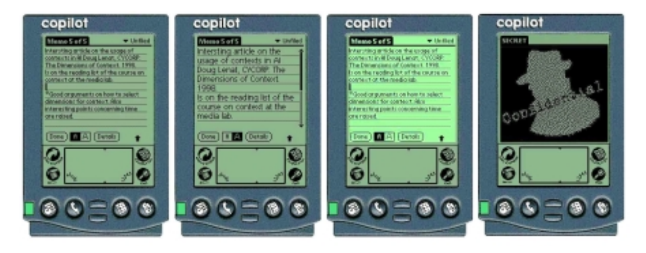
Figure 6: Adaptation to Context a) small font, b) large font, c) backlight, d) privacy

walking the passive infrared sensor is deployed.