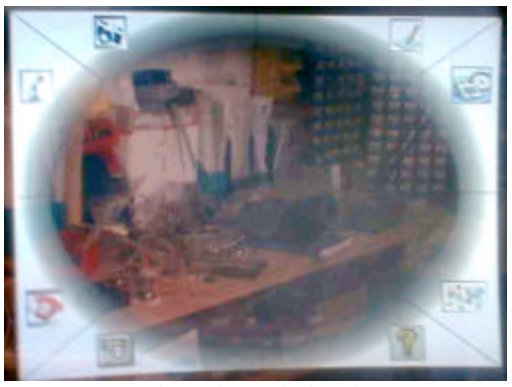
Figure 3: Looking through the glasses

All interaction elements are arranged around the border of the display. The display is separated in nine regions, eight sectors of each 45° and the middle oval. The sectors are used to display information chunks or controls. They are rather small to offer optimal visual acuity for single items in the display. Using this layout the head stabilized information is never blocking the sight of the user. It has also the advantage that if the user is focusing an objects in the real world the border gets out of focus and disappear in the field of vision. The middle region is as, shown in figure 3, transparent and can be used to display word stabilized information. This region should be carefully used not to block vision.